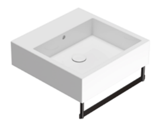
Cod. PT003CR Frontal brass chromium-plated towel rail 46 x 9 cm. Weight 1,4 Kg

Frontal black steel towel rail 48,510 h 5 cm. Weight 0,9 Kg.