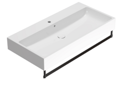
Cod. PT010CR Frontal brass chromium-plated towel rail 96 x 9 cm. Weight 1,6 Kg

Frontal black steel towel rail 98.10 h 5 cm. Weight 1,4 Kg.